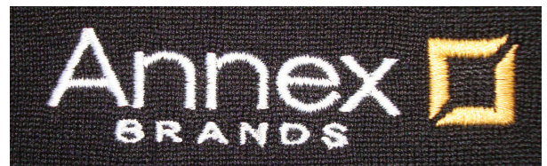
Correct: Annex Brands logo on dark colored shirt