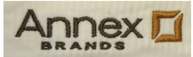
Correct: Annex Brands logo on light colored shirt

When embroidering the Annex Brands logo, the same guidelines apply that are described in Section 2, page 1.4 with regards to the overall look of the logo. See samples in the right-hand column for more details.